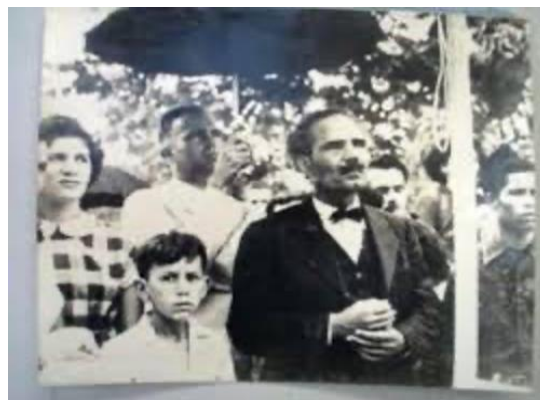
Don Pedro Albizu Campo

He has fiercely fought the ruthless attacks of LGBTI gender ideology and radical feminism. He has lost a battle, but not the war.