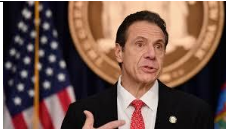
Andrew Cuomo; Man with initial stage Battered Man Syndrome. He was unable to recover from the abuse and defends LGBTI gender ideology and radical feminism, having been falsely and clearly accused of sexual harassment for political purposes.