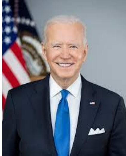
Joe Biden; Man with Battered Man Syndrome in remission. He recovers satisfactorily.