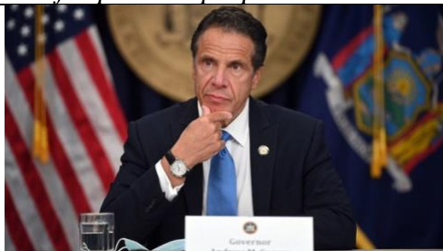
Andrew Cuomo; Man with Battered Man Syndrome stage in remission. He recovers satisfactorily.