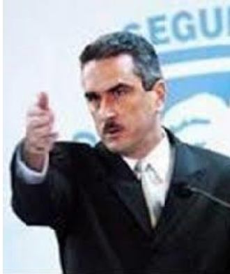
Thomas Rivera Schatz

He has fiercely fought the ruthless attacks of LGBTI gender ideology and radical feminism. He has lost a battle, but not the war.