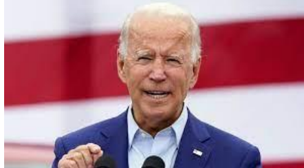
Joe Biden; Man with Battered Man Syndrome critical stage. He was unable to recover from the abuse and defends the LGBTI gender ideology and radical feminism, after being falsely accused and for clearly political purposes of sexual harassment in the electoral campaign in order to favor his female political opponent.